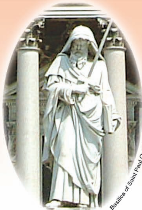
Basilica of Saint Paul Outside the Walls, Rome, Italy

The Apostle of the Gentiles, who was particularly committed to bringing the Good News to all people, gave everything he had for unity and harmony among all Christians. May he guide and protect us in this bimillennium celebration, helping us to go forward in the humble and sincere search for full unity between all the members of the mystical body of Christ.